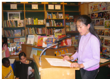
Storytelling Exchange Students Read their stories at A Clean Well Lighted Place for Books

There are lots of different ways to be part of Streetside! To find out more, give Tara a call at (415) 864-5221, email her at tara@streetside.org or visit our website at www.streetside.org.