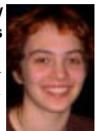
Me Talk Pretty One Day By David Sedaris

This hilarious collection of autobiographical stories chronicles the author's adventures and disasters growing up with a family that is, to say the very least, unconventional. I love the way he looks at the world as a joke just waiting to happen, where anything carefully examined becomes absurd and funny.