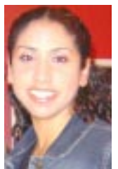
Rain of Gold by Victor Villaseñor

Although read long ago, this book left me with a lasting impression and a greater appreciation of my heritage. Villaseñor combines captivating and historical events to depict his family's journey from Mexico to the U.S. during the Mexican Revolution. It is an inspiring true story that incorporates adventure, romance, humor, and tragedy—an epic you will want to share with others as well.