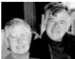
The Age of Grief By Jane Smiley

This is a collection of short novellas about the unexpected turns of love, marriage, parenthood, and friendship. The stories are not very happy, but Smiley writes with great power about human relationships that we can connect to the dilemmas in our lives. The poignancy of the problems reminded me of the stories Streetside's students have written about this year.